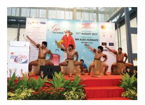
We were delighted to welcome over 81,000 visitors of all ages, backgrounds and travelling patterns to our 51st travel fair. See you at the next one!