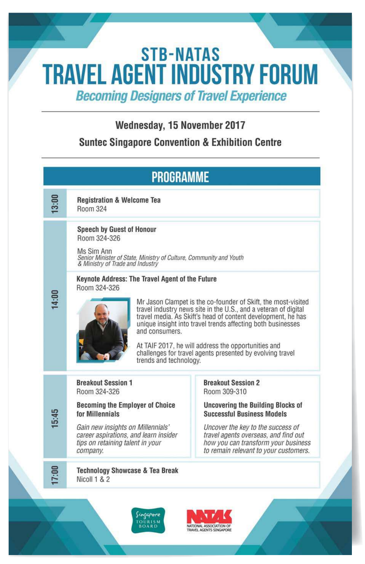
The event is for registered participants only. Register here: http://www.cvent.com/d/ctq0m5/4W