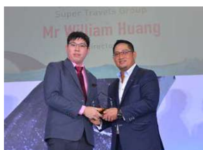
Super Travels Group