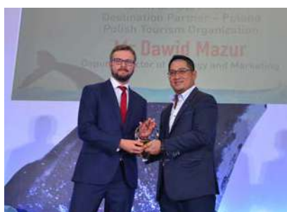
Polish Tourism Organization