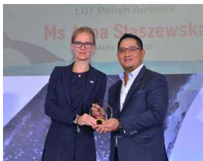
Lot Polish Airlines