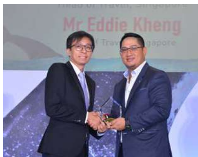
AIG Asia Pacific Insurance Pte Ltd

Thank you all who were a part of NATAS Holidays 2019. We are extremely grateful for your continued support throughout the years! On behalf of the association, we would like to express our appreciation to our Major Sponsors, AIG and Destination Partner Poland, co-helmed by Polish Tourism Organization and LOT Polish Airlines. We would also like to give a shout out to all our Sponsors especially Singapore Airlines and Super Travels for their generous sponsorship and prizes.